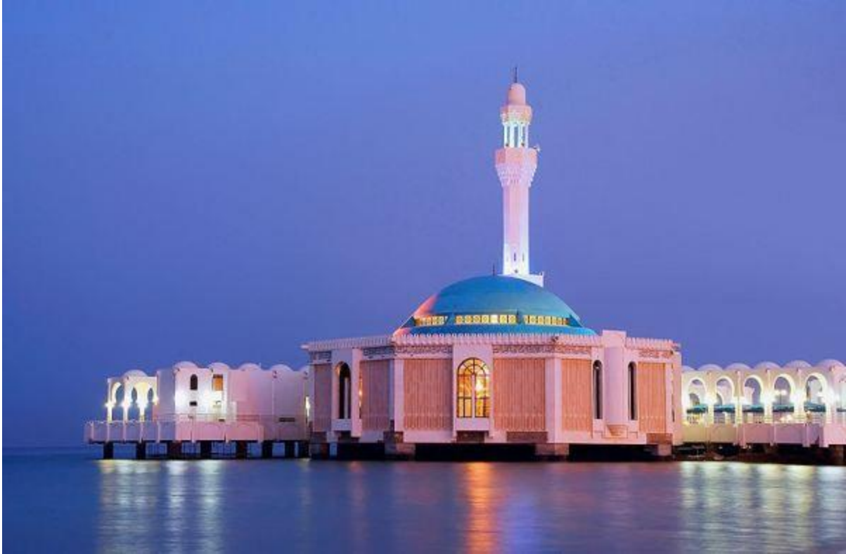
MOSQUE ON THE WATER