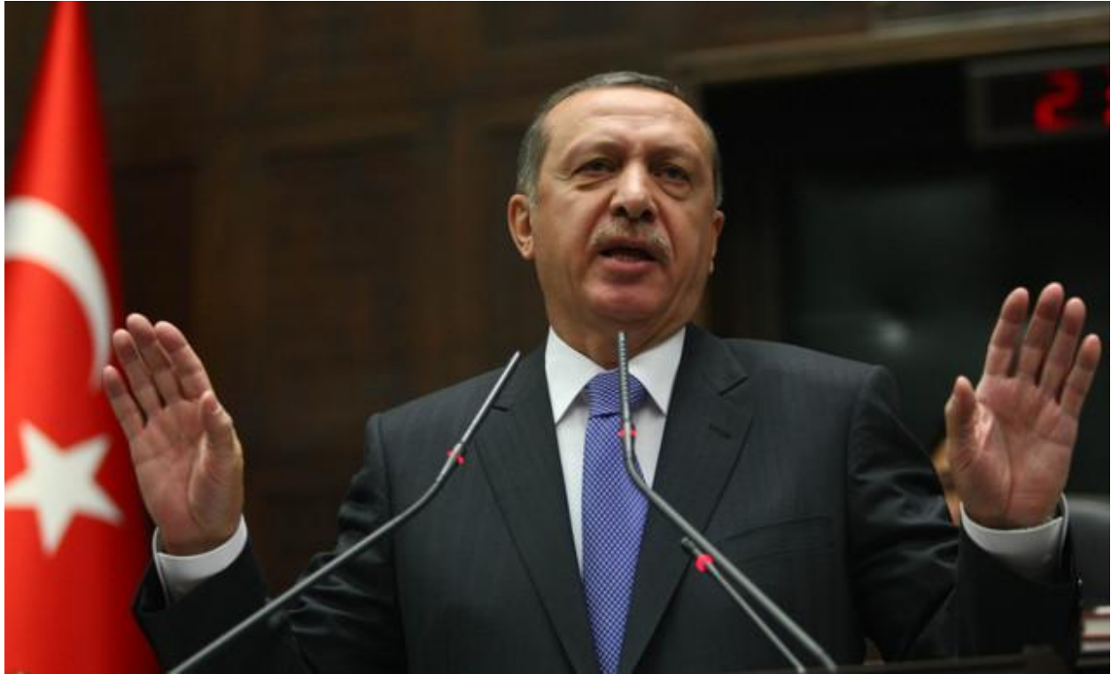
Erdogan, Turkey's President

To see how far back Erdogan was involved in the Naqshabandi movement watch this wakeup call by Naqshabandi Sufist Imam giving a speech in the presence of Erdogan and Erbakan and hear what he said about taking over the world: