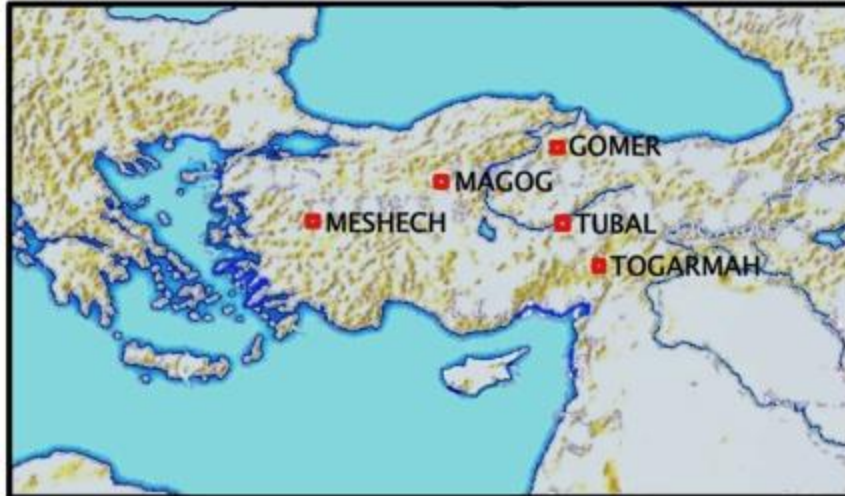
The New Moody Atlas of the Bible p. 93 places Magog in Turkey.