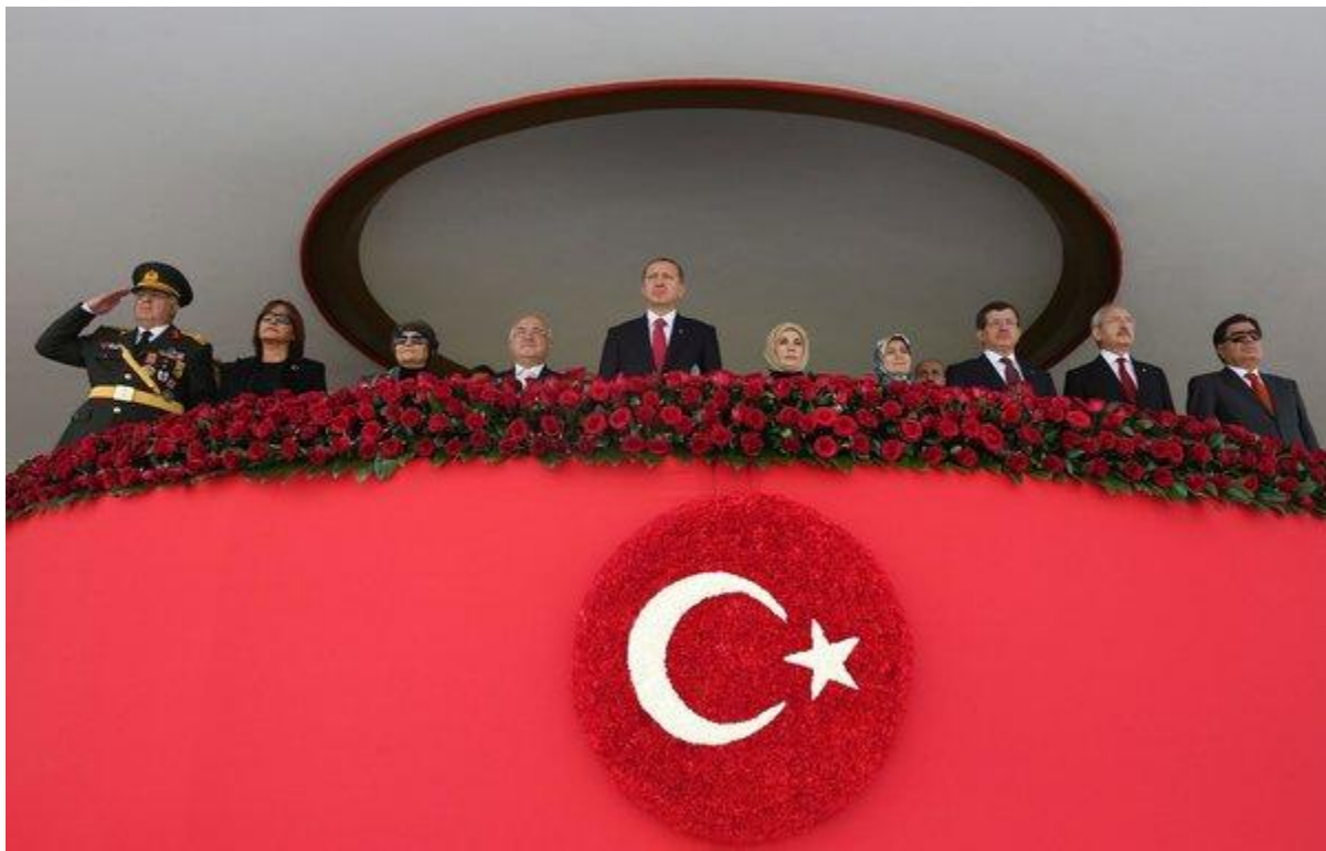
President Recep Tayyip Erdogan, center, at a Republic Day ceremony on Wednesday at the Ataturk Cultural Center.

Some might object that Babylon (the lion) is not Arabia but Iraq. But a closer look at prophetic Babylon of the end days, the Bible has no mention of any of the ancient provinces of Babel, Sumer, Accad, Erech, Calneh but “Kedar,” “Dumah” which are in Arabia and then mentions literally “Arabia” (see Isaiah 21, Jeremiah 49).