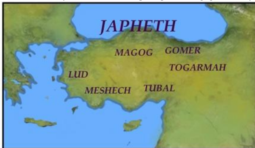
The Zondervan Atlas of the Bible p. 83 places Magog in Turkey.